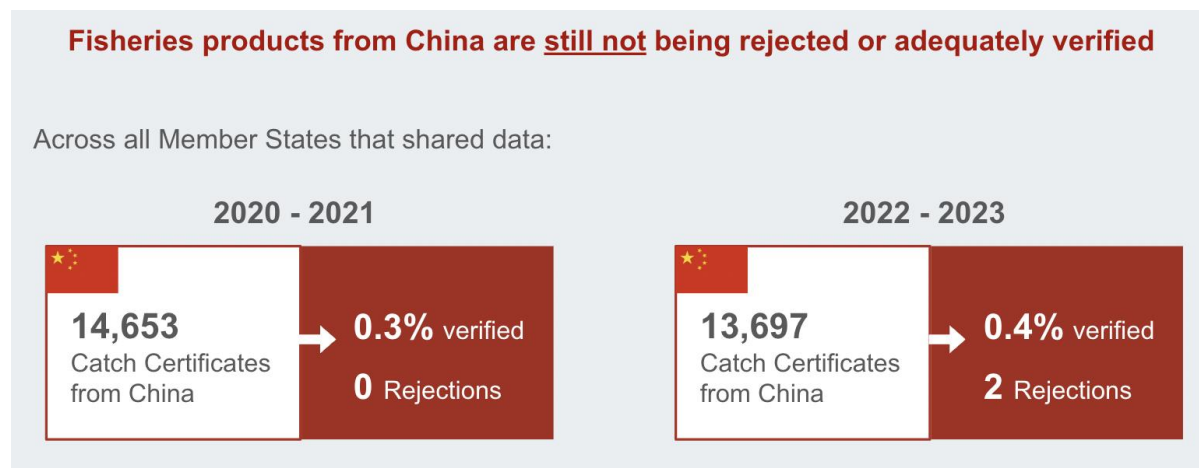
Figure 2: Catch certificates for fisheries products from China are still weakly verified and rejected in 2020-2023

In addition, most Member States report not conducting verifications with states other than the flag states (i.e., processing states, storage states, etc.) or do not provide such information. For instance, between 2020 and 2023, Spain sent 215 requests to states other than flag states, whereas other large importing countries like Italy and Portugal did not report sending any. If that trend is confirmed, it further suggests a lack of thorough verification of catch certificates and is particularly concerning given that about 30% of all processing statements received across the EU come from China, a country where some seafood processing plants are suspected to be linked to illegal activities. 23 It is also noted that some Member States (e.g., Italy) do not provide the required information on the number and origin of the processing statements received.